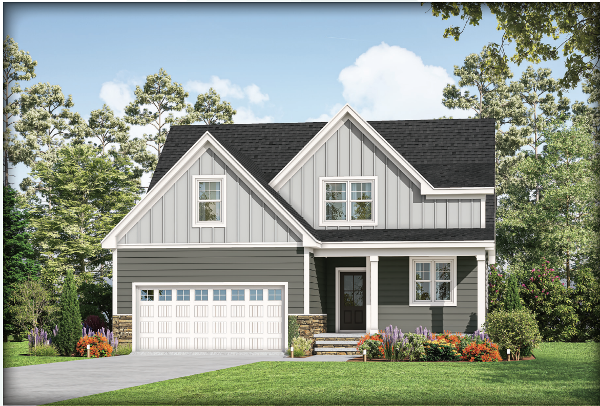
ELEVATION A - FRONT LOADING