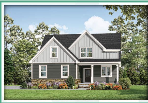
ELEVATION A - SIDE LOADING